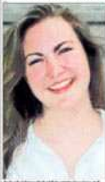
Portrait of the vicar who couldn't reconcile her faith with forgiveness of her daughter's killers